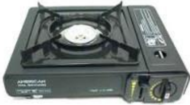
Butane Table Top Stove Product Code 602011

This appliance is only for professional use by a qualified operator